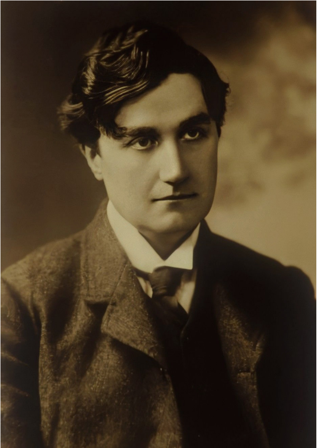
Ralph Vaughan Williams, 1903