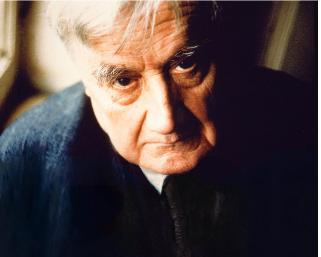
1952, Ralph Vaughan Williams colour photo taken 'at request of Percy Grainger'