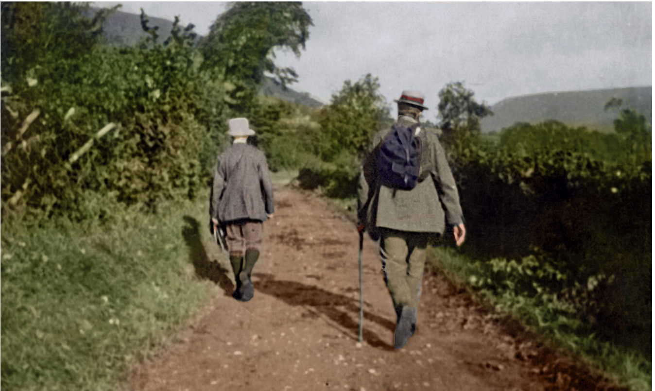
Vaughan Williams (right) walking with Gustav Holst, 1921